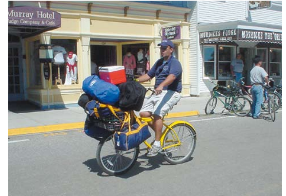
A classic big load. Note the luggage hanging from the basket sides.

At the peak of one crazy era, porters used 'launchers' – guys who held them up and gave them a push when