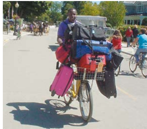
BELOW: OK, now here we're getting to a bigger load...

In general a very high seat position is employed. Mountain bike bar-ends are sometimes added to give an extra hand position. One pedals on tippy-toes to get maximum power on these short but intense journeys. A delivery is a mile at most.