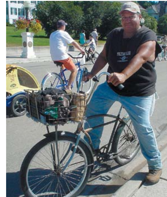
ABOVE: Dock porters aren't the only folks who ride. This fellow rides a bike that's as old as he is – both circa 1958. The front basket is pretty much the rule for Island bikes.