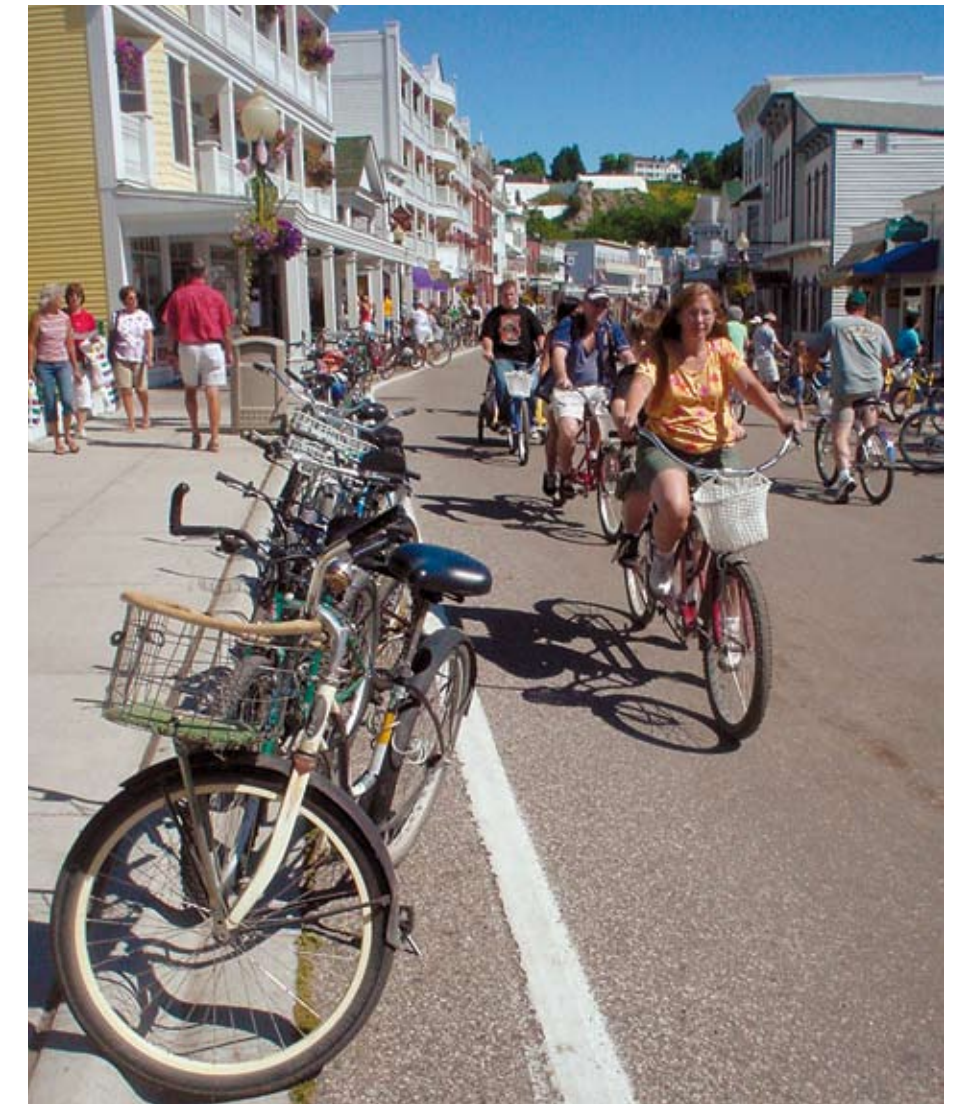
Typical street scene. Tourists riding rental bikes, often on around-the-island tours. An array of Island bikes line the curb. Note the carpet-covered plywood base in the basket of the first bike.