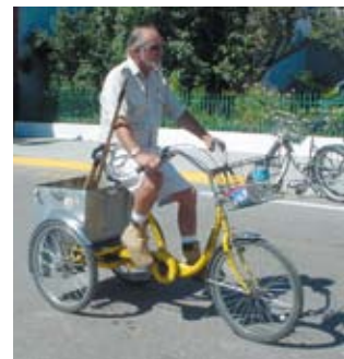
A street-sweeper's trike.

their load was ready. Some riders couldn't see beyond their loads. 'Front-runners' cleared the road ahead for porters who felt they didn't have enough good karma.