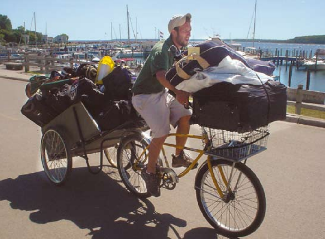
Big trailers are frequently used in addition to the front basket. What a fine load!