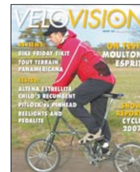
COVER PHOTOGRAPH: Riding the Esprit.

Velo Vision is printed on paper produced from sustainable forests to Nordic Swan standards.